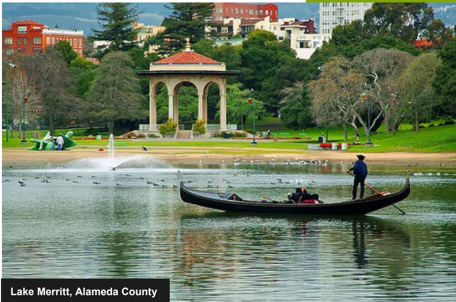
Lake Merritt, Alameda County

If you have questions regarding this bulletin, please contact: